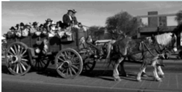
▲ Horses draw an official parade entry float over the "Road Apple Roulette" grid.